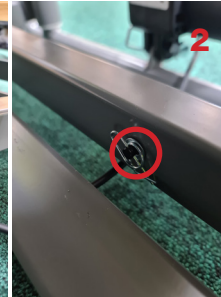
Cable roller arrives fitted to actuator cable and only needs a pin pushing through the frame and locking with a clip.

For more information please call your Business Development Manager, or contact our helpful Customer Service team.