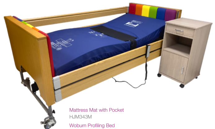
Mattress Mat with Pocket HJM343M