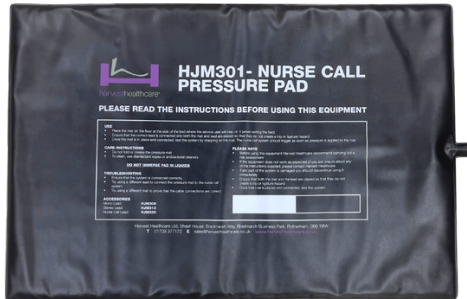
Floor Mat HJM301