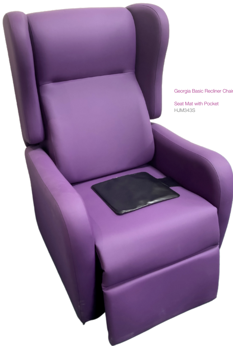
Georgia Basic Recliner Chair Seat Mat with Pocket HJM343S

A streamlined wireless design that fits perfectly into any nurse call system, our Guardian is specifically made to address the limitations of traditional falls alarm systems.