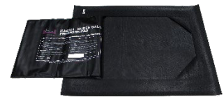
HJM302 Sensor Mat Carpet Cover Please ask for more information