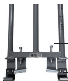
Fixing Bolt (HLB690)